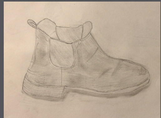
Year 7 rotation in Art has allowed students to explore the formal element of tone. They have used pencils or watercolours to create their assessment pieces.