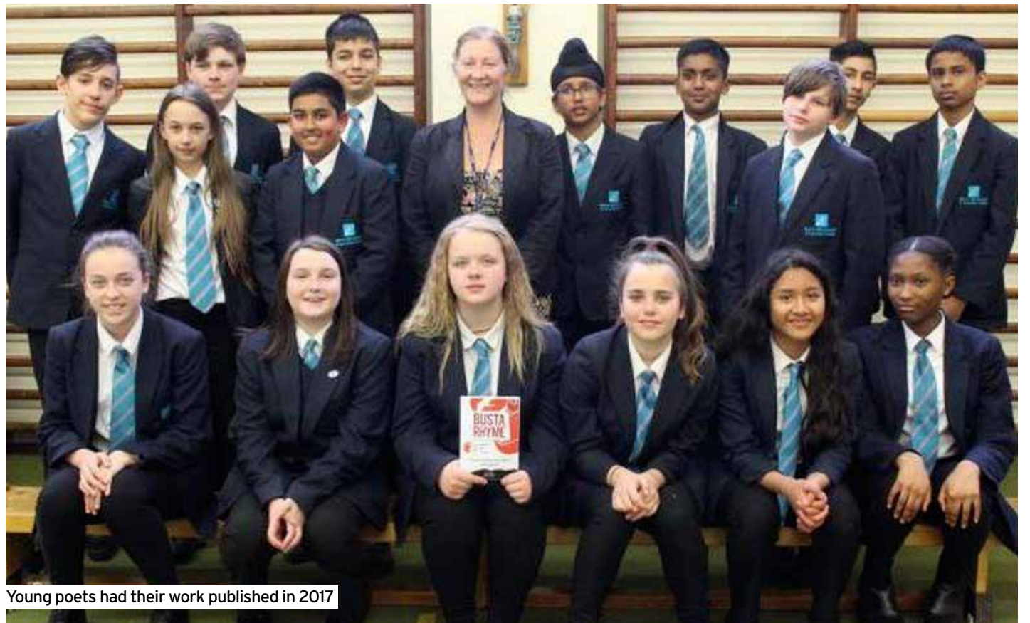
Young poets had their work published in 2017