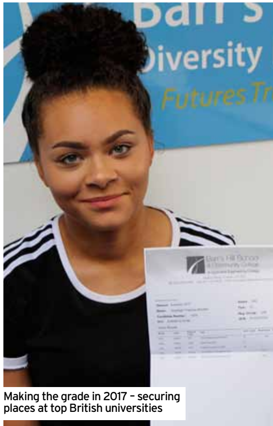
Making the grade in 2017 - securing places at top British universities